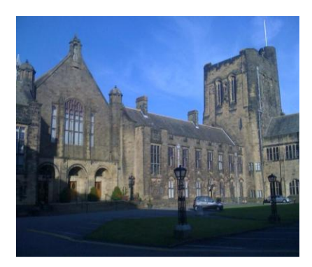
Bangor University, ESPACOMP2009