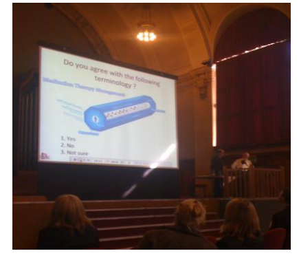
The consensus meeting coordinated by the ABC ESPACOMP2009